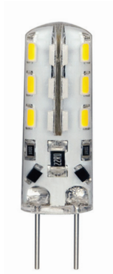
TANO G4 SMD-WW