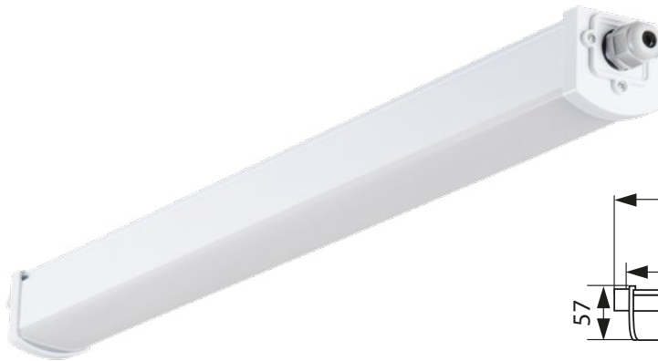
NOME N LED SMD 18W-NW