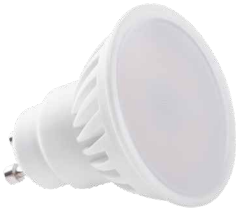
TEDI MAX LED GU10-WW